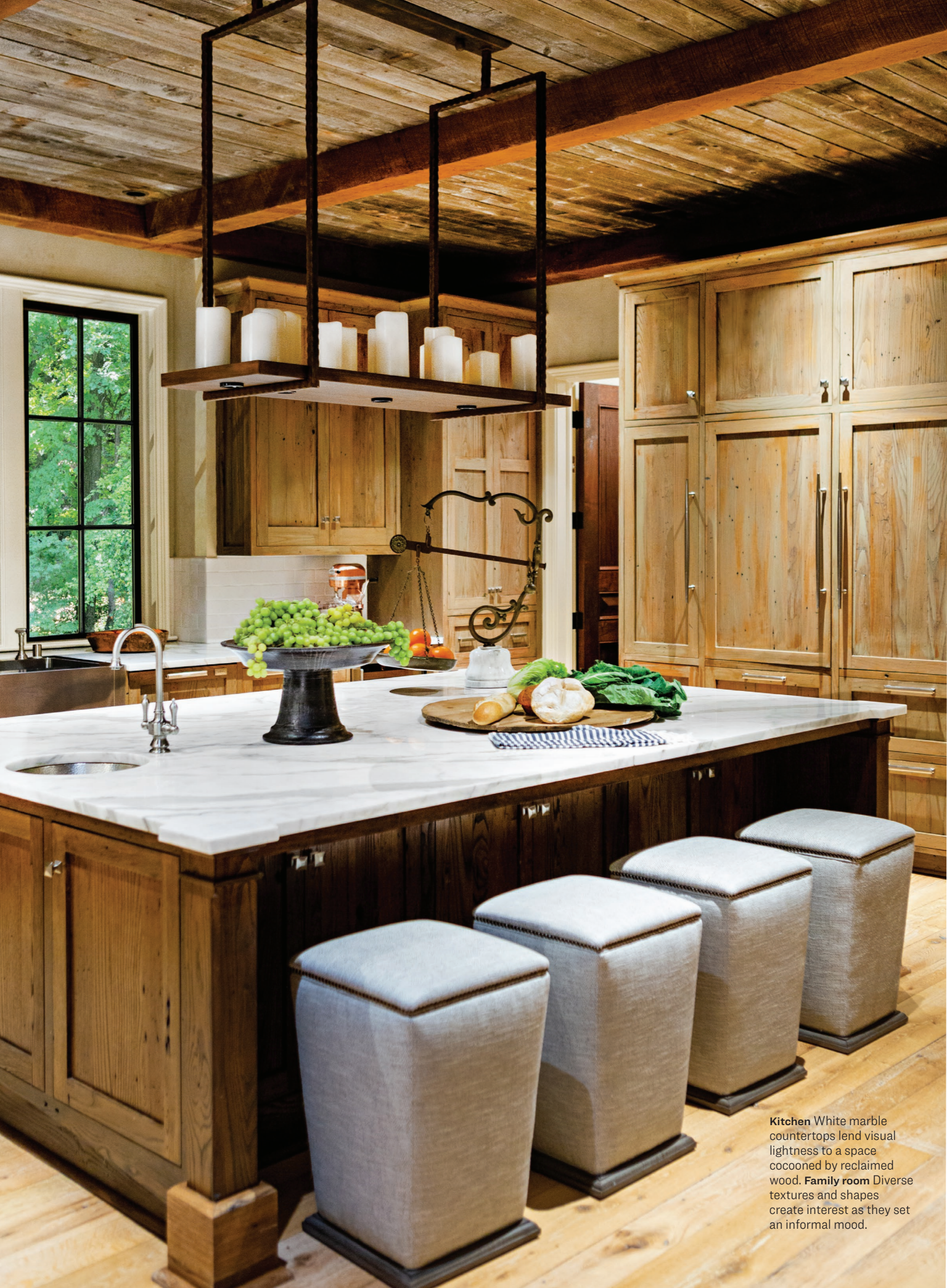
Kitchen White marble countertops lend visual lightness to a space cocooned by reclaimed wood. Family room Diverse textures and shapes create interest as they set an informal mood.